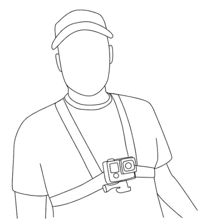
Hands-Free Recording Equipment

Try to make the process of recording dialogues unobtrusive: if you are distracted by the filming process, it will likely distract your interlocutor as well.